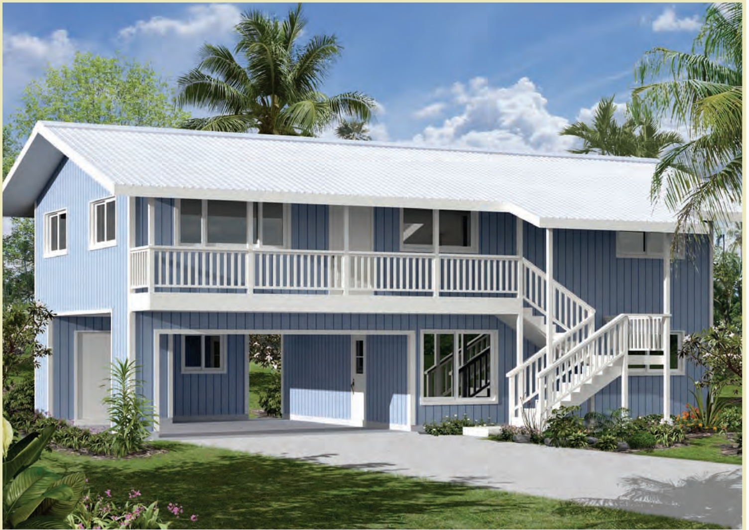
THE KILOHANA Illustration ©2008 Honsador LLC