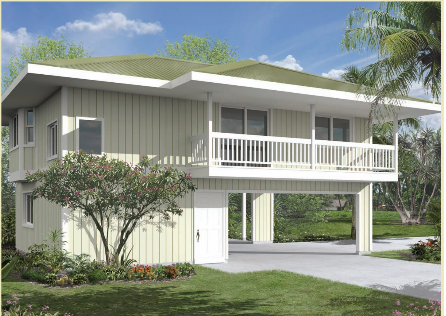
THE NOHONA Illustration ©2008 Honsador LLC