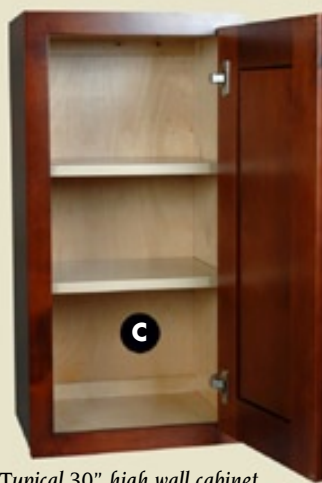
Typical 30" high wall cabinet

Kekoa , the Strong, Brave, Courageous Soldier epitomizes the motivation for creating this collection. This cabinet, also dubbed "The Warrior", is our project level cabinet line. We engineered "The Warrior" to be tough, strong and lighter but equipped with features and hardware that would allow it to function and look better than its market peer group, while being priced right. Indeed, Kekoa is designed and priced for project work but quality has been built in and more importantly that quality is assured by Honsador's " QualityTouch™ " program. We insist on quality and assure it by placing a Honsador representative at the manufacturing source. Only product that passes the " Quality-Touch™ " makes it to Hawaii and your project. Kekoa is a collection that will stand tall when compared to other project level cabinet lines. Check out the features shown below: