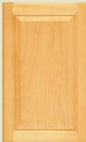
Natural Birch/Raised Panel Style

Finished in Honsador's Exclusive "Waimea Sea Salt" Stain Finish