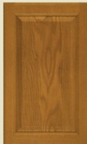
Natural Oak/Raised Panel Style